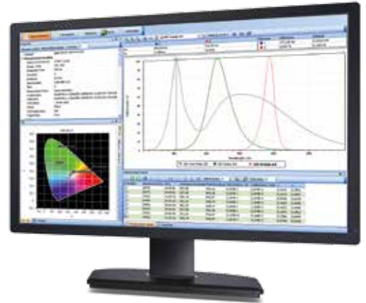
▲ SpecWin Pro spectral analysis software.

SpecWin Pro and SpecWin Light spectral software packages have been developed for a wide range of interactive semi-automatic and even fully automatic laboratory applications. Each package features comprehensive functions for analysis and documentation of test results.