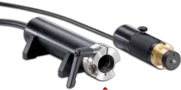
▶ Adapter and test socket for averaged LED intensity measurements.