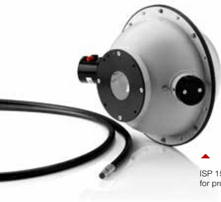
▶ ISP 150L Integrating Sphere for production applications.

fiber-optic measurement adapters for use in the front-end-of-line processes. These probes can be operated under a microscope and permit fast configuration of the wafer and continuous positional control during testing. The probe's high light throughput also facilitates very short measuring times even with low-power LED chips.