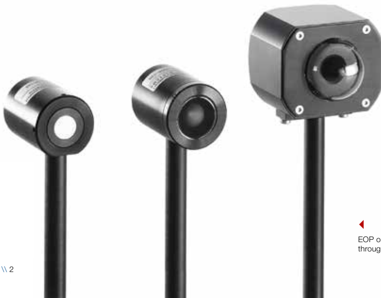
◀ EOP optical probes with different light throughput and angular response characteristic.

Like all spectrometers from Instrument Systems, the CAS 120 can be combined with any of a large number of adapters and other accessories using fiber-optic cables to permit a wide range of different tasks for one spectrometer. This enables the CAS 120 to be deployed efficiently in production, quality assurance, as well as in research and development. The integrated density filter wheel and the dark-current shutter also facilitate fully automated measurements over an extremely broad signal range.